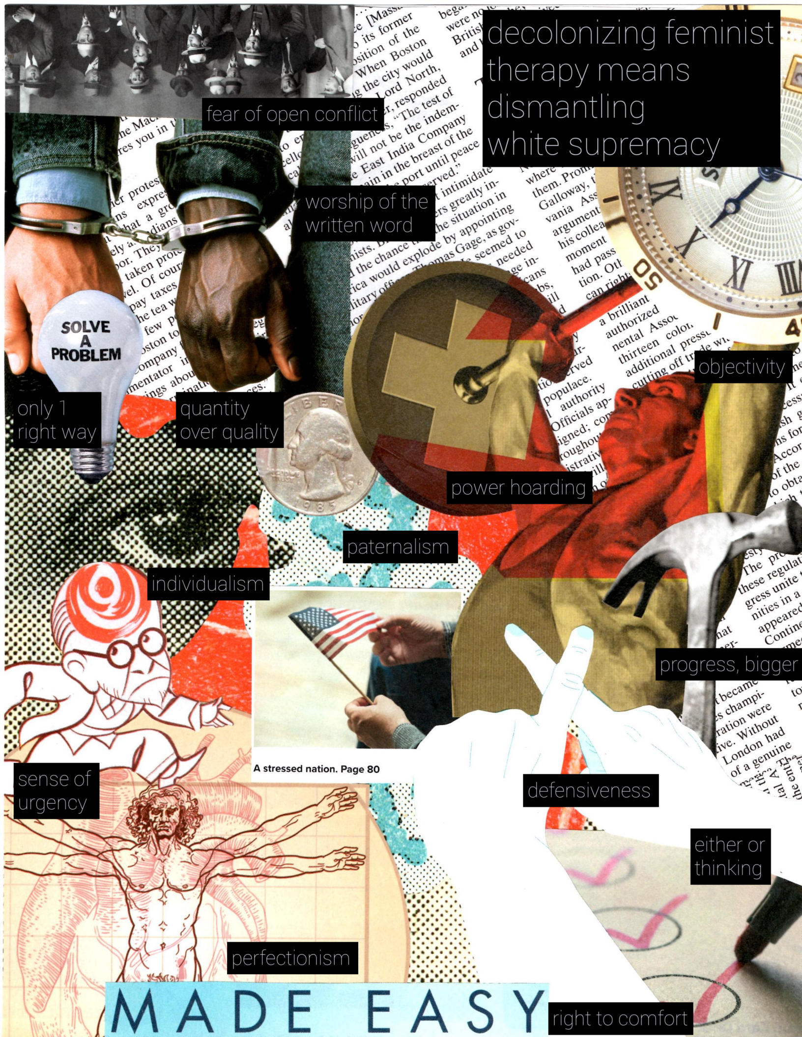
A stressed nation. Page 80