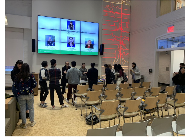
Participants speaking with panelists after the Q&A session